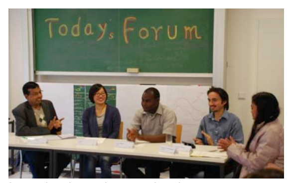
Intercultural experience and exchange