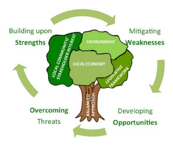
Fig. 2: The CIPSEM approach by J. Fevrier (St. Lucia), participant in 2014

"The lectures are unique and given by experienced professors from TU Dresden and also experienced experts in the other fields. I liked the field visits and excursions to combine theory with practice."